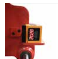
3 Depth load engagement sensors Detect type and configuration of the load in depth/height and the distance from the clamp body.