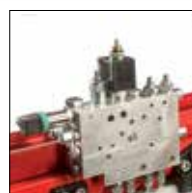
2 Proportional valve Commands the hydraulic pressure in the clamping cylinders.