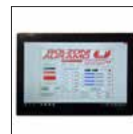
3 Set up Tablet Controls the parameters of the pressure configuration based on opening ranges.