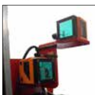
1 Laser detector Laser sensor for upper row to detect presence of boxes in the upper part of the pads.