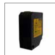
4 Opening laser sensor Detect the opening of the clamp and position of the arm