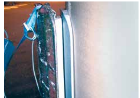
The Test Pad measures the clamping force between the paper roll and the clamp pad.