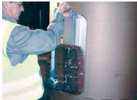
Due to its thin design, the Test Pad adapts to changing roll diameters.