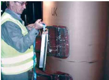
The Test Pad is light to carry and easy to handle.